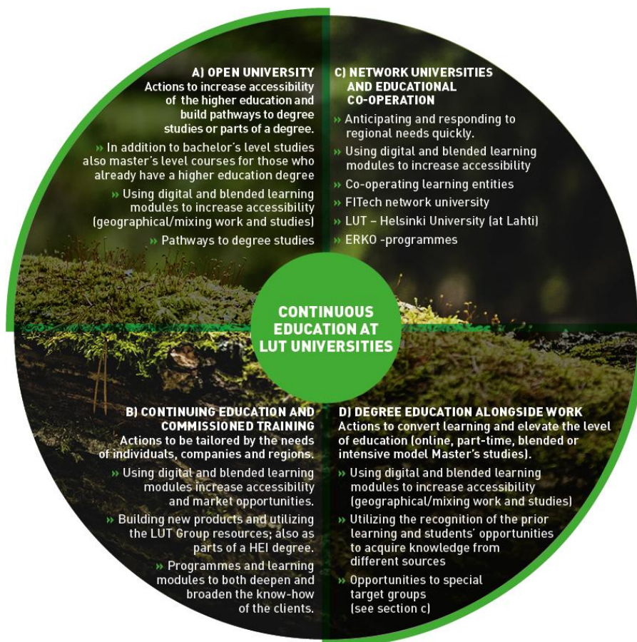
Figure 5. Continuous learning framework at LUT

LUT has developed modes of continuous learning according to the increasing needs of society to provide flexible educational paths for different target groups (Figure 5). Planning for continuous learning is an integral part of curriculum work. In the planning of continuing education and on-demand training, customer needs set the starting point.