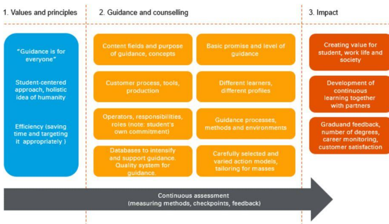
Figure 7 Student-centered guidance model at Metropolia

In a self-assessment, the need to monitor studies in a student-centered, more personalized and more comprehensive manner was identified. Doing so would make it easier to address a situation where the study progress is slower than planned, for example. An answer to this is provided by the learning guidance model (figure 7) which is being developed together with students as part of the Metropolia Match® model. The model makes use of existing good practices. The guidance model supports the student’s active approach in self-development and in progressing towards the direction they have chosen.