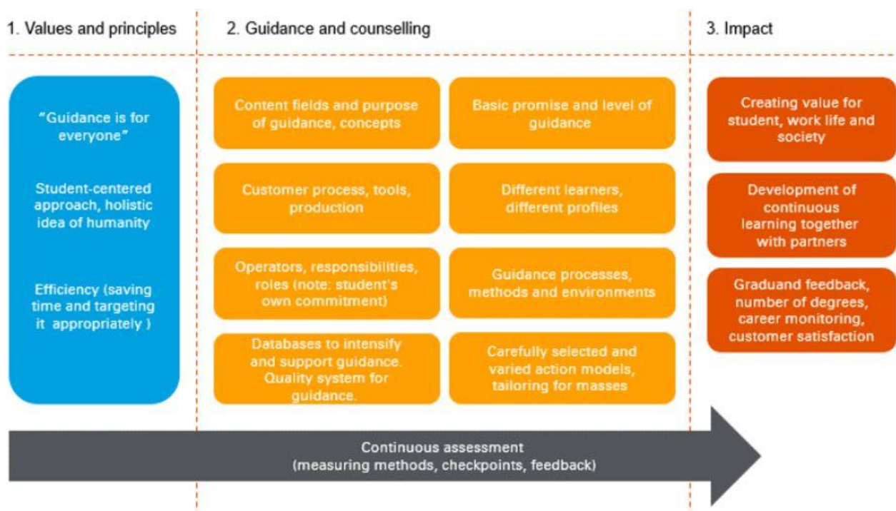
Figure 7 Student-centered guidance model at Metropolia

In a self-assessment, the need to monitor studies in a student-centered, more personalized and more comprehensive manner was identified. Doing so would make it easier to address a situation where the study progress is slower than planned, for example. An answer to this is provided by the learning guidance model (figure 7) which is being developed together with students as part of the Metropolia Match® model. The model makes use of existing good practices. The guidance model supports the student's active approach in self-development and in progressing towards the direction they have chosen.