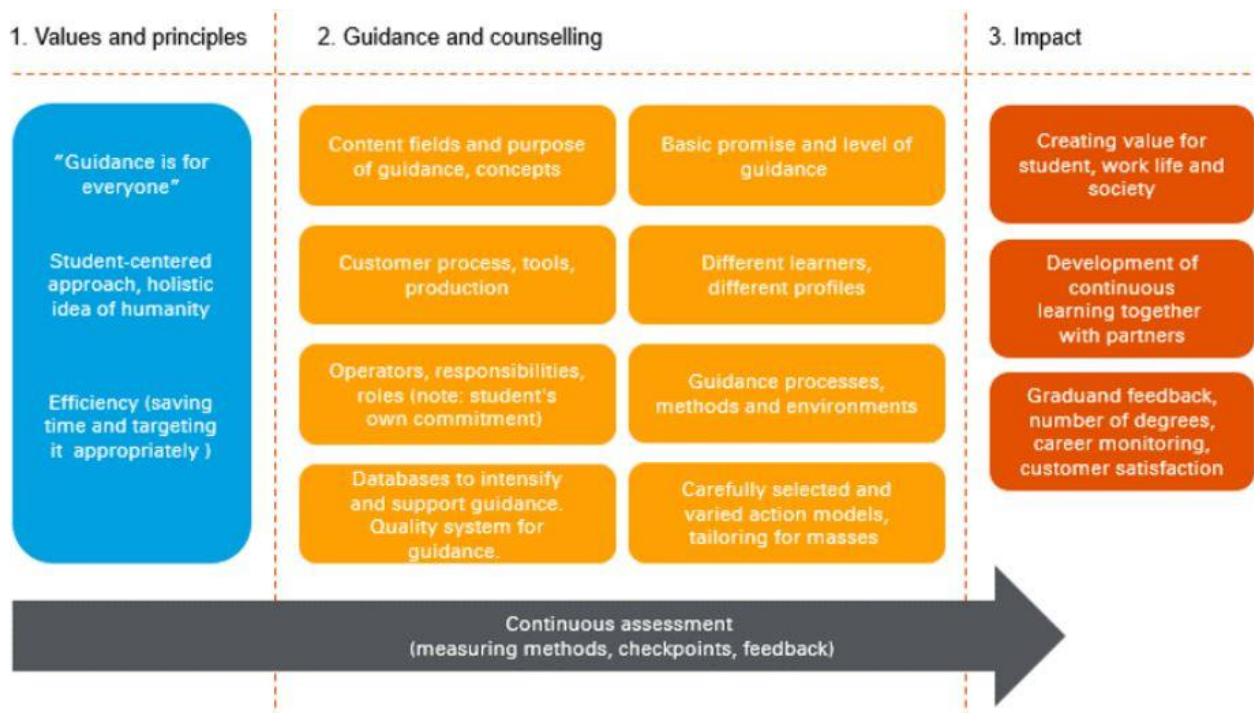
Figure 7 Student-centered guidance model at Metropolia

In a self-assessment, the need to monitor studies in a student-centered, more personalized and more comprehensive manner was identified. Doing so would make it easier to address a situation where the study progress is slower than planned, for example. An answer to this is provided by the learning guidance model (figure 7) which is being developed together with students as part of the Metropolia Match® model. The model makes use of existing good practices. The guidance model supports the student's active approach in self-development and in progressing towards the direction they have chosen.