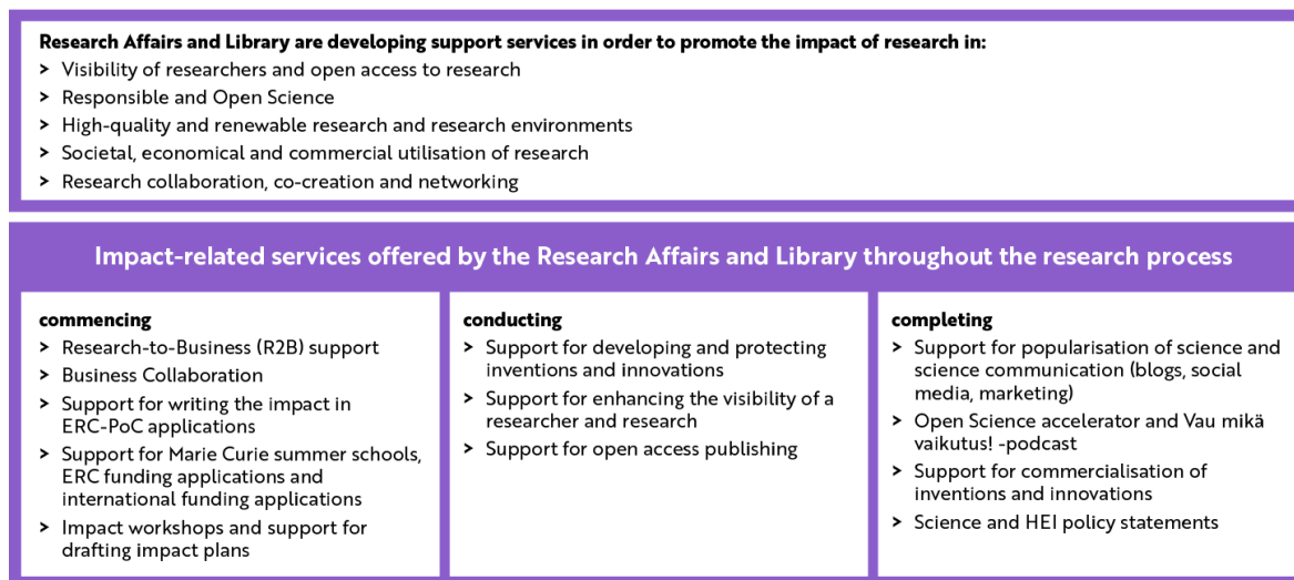
Figure 11. Services and tools to promote the impact of research

Affairs unit and the Library mapped the services and tools that help researchers to promote the impact of their research throughout the research process (Figure 11). By mapping the existing services, the gaps were identified and the services can now be developed further.