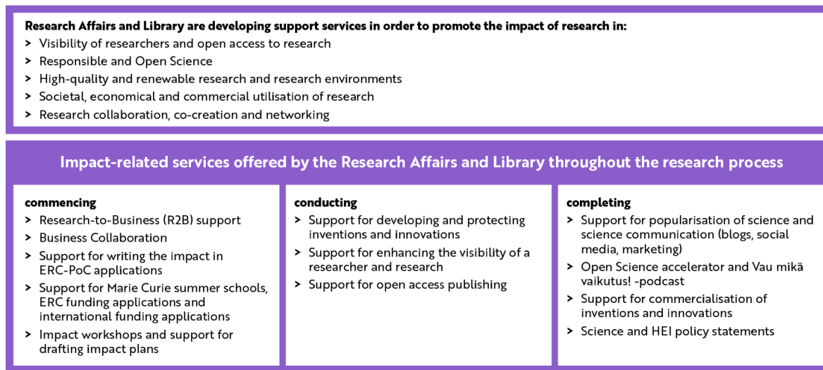
Figure 11. Services and tools to promote the impact of research

There are support services for promoting the societal impact of research at UTU. The Research Affairs unit and the Library mapped the services and tools that help researchers to promote the impact of their research throughout the research process (Figure 11). By mapping the existing services, the gaps were identified and the services can now be developed further.