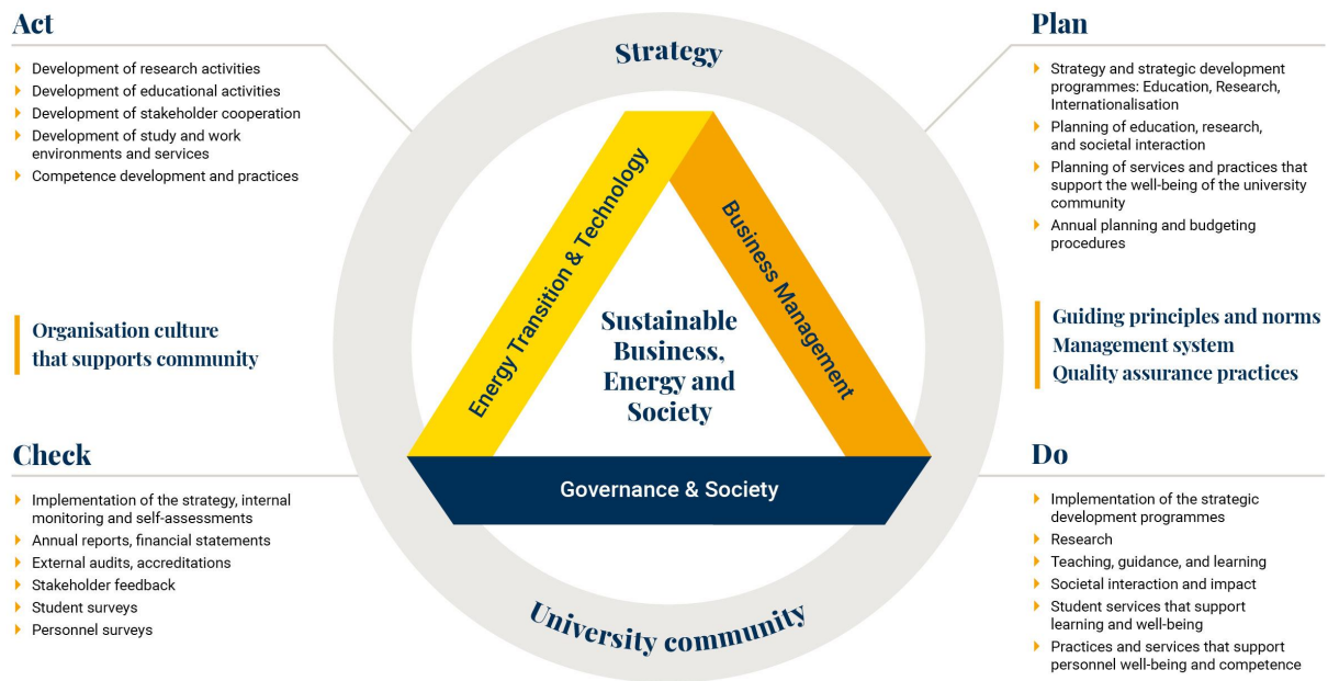
Figure 6. The PDCA Model of the UVA Quality Management System

UVA's mission, vision and strategic objectives were developed in a participatory process, engaging the whole university community. The process is guided by universities' statutory obligations and the strategic targets agreed with the Ministry , which include degree targets, internationalization, and the profiling of research. This is supplemented by the national financial model for universities .