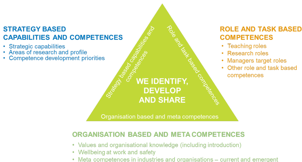
Picture 22. Competence model