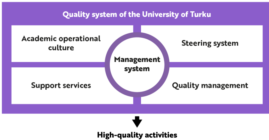
Figure 24. The quality system of UTU

The entire UTU community participates in the continuous development of high-quality operations as part of their work. Structurally, quality work follows the organisational structure that consists of faculties, independent units and support services. Figure 25 presents the key operational roles of quality work in UTU.