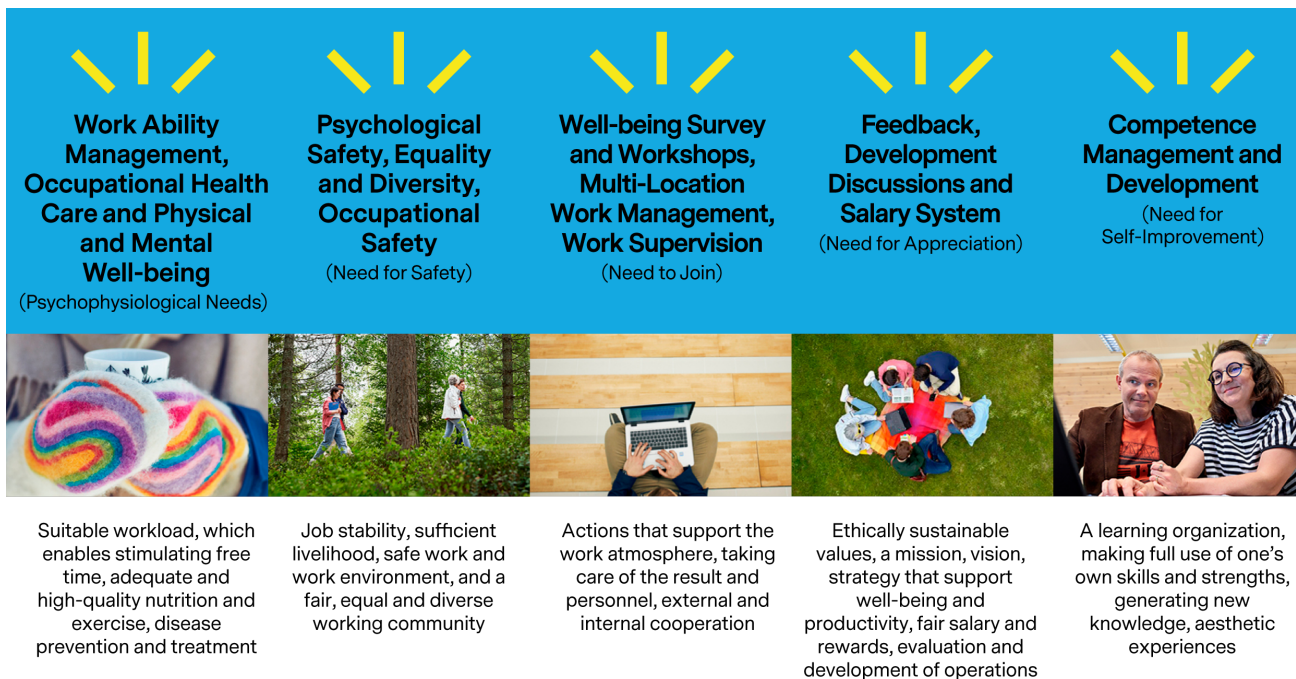
Figure 11. Service and support themes for line managers to manage work ability and well-being.

Staff well-being is challenged by insufficient overall understanding of the elements that support well-being and work ability, as well as the knowledge of the tools and services that support them. In particular, the insufficient management of workloads and other psychosocial factors is reflected in the number of absences due to mental health reasons. The goal is to increase both awareness of mental health and services that support mental health.