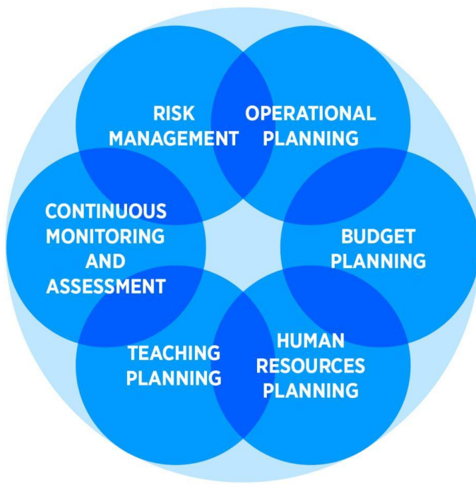
Figure 10. The UH's operations management process