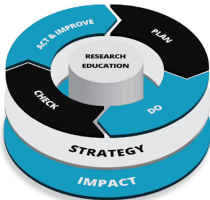
Figure 8 High-quality activities at UEF