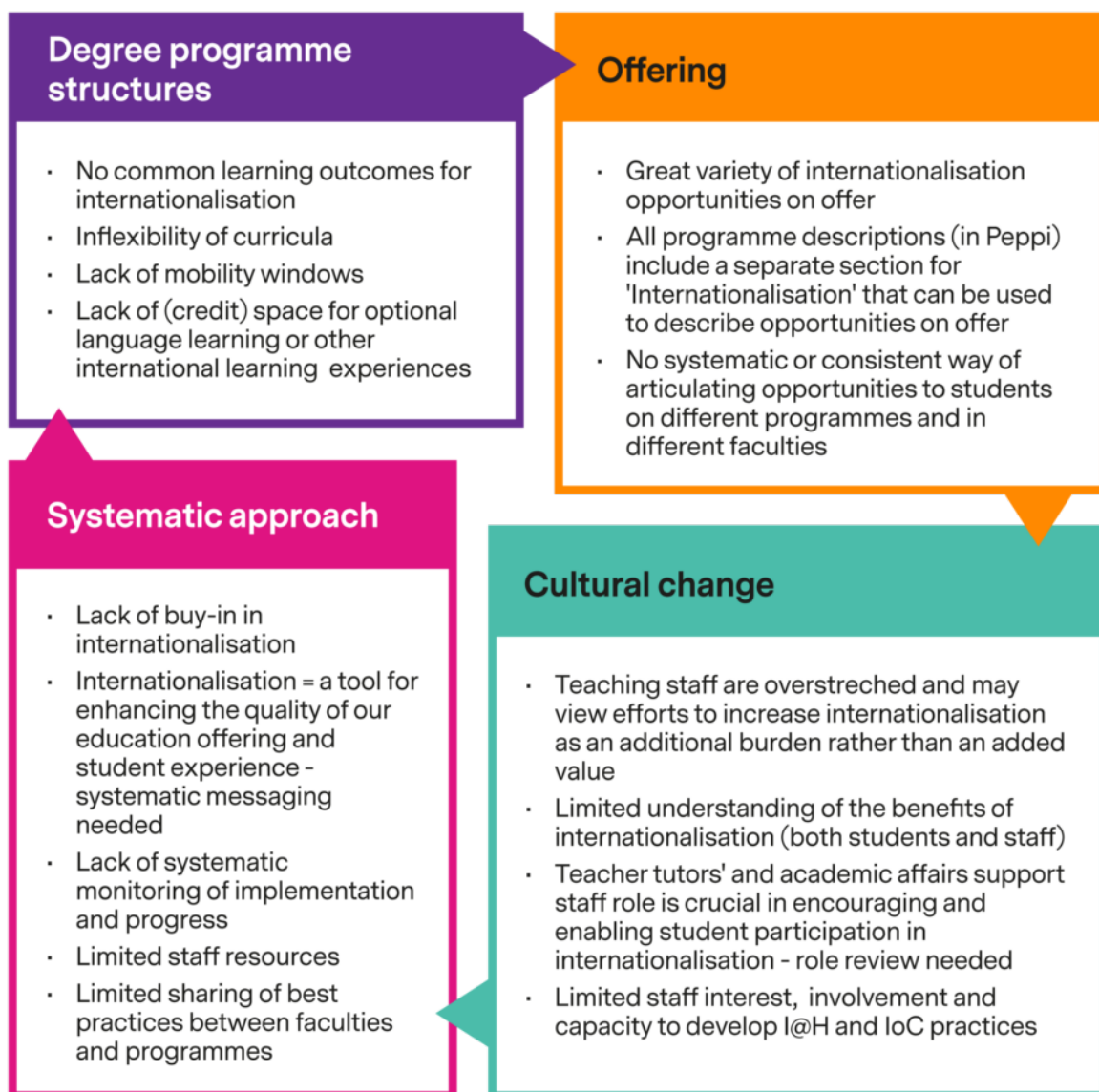
Figure 17. Key challenges in the internationalisation of degree programmes and student experience.