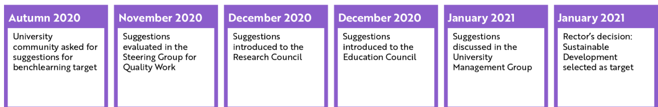
Figure 29. Process for choosing the target for benchlearning

As a target, sustainable development is of strategic importance to the University. It is an underlying theme in the UTU Strategy and a cross-cutting topic embedded in all operations from research to education, and from societal interaction to campus development. UTU aims to further integrate sustainability in its activities and strengthen its role as a frontrunner in sustainable development. The importance of sustainable development at UTU shown in figure 30.