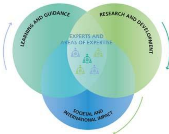
Picture 4. Integrating our main processes

Our organisation was restructured at the beginning of 2021 and is currently based on a holistic way of implementing our main processes: 1) learning and guidance, 2) research and development, and 3) societal and international impact. Competences are at the centre and through them we produce excellence in all our main processes. We aim at utilising the skills and strengths of everyone in Haaga-Helia.