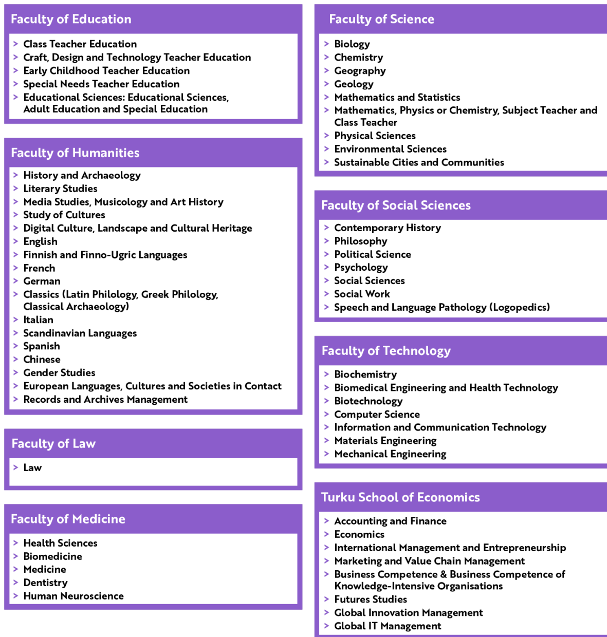
Figure 2a. Fields of Education in the eight faculties of UTU

Doctoral training is coordinated and organised by the University of Turku Graduate School (UTUGS) together with the faculties. UTUGS consists 16 doctoral programmes which cover all disciplines of UTU. The doctoral programmes are not bound to faculties or departments but can bring together doctoral researchers and supervisors from different fields as shown in figure 2b.