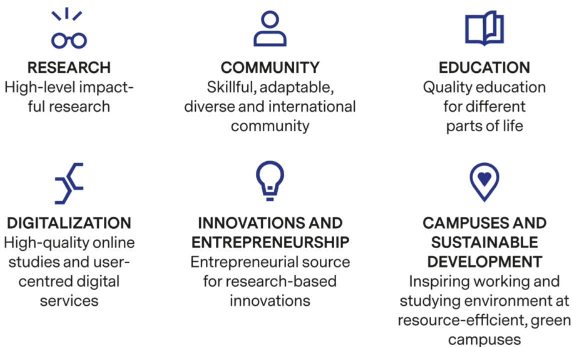
Figure 3. Strategic development programmes.

Our research focus areas (Fig. 4), profile fields and strategic development programmes (Fig. 3) will steer the University's development in the coming years. At the UO we have four focus institutes: Biocenter, Eudaimonia, Infotech and Kvantum which promote research co-operation that crosses faculty boundaries in our multidisciplinary focus areas. The focus institutes promote interdisciplinary and internationally significant research in the focus areas defined in the university's strategy. Our researchers contribute to solving global challenges in strategic spearhead research projects and in the emerging projects organized under the focus institutes. Part of the UO's strategic research funding is directed at the interdisciplinary, internationally reviewed 4-year spearhead projects.