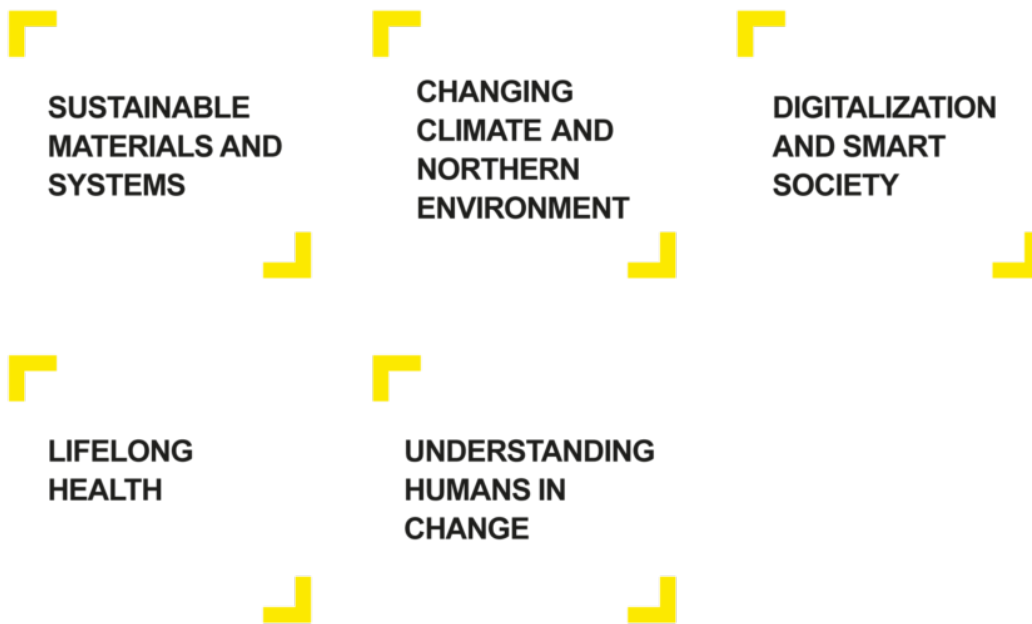
Figure 4. Research focus areas.

The values of the university community : creating new, taking responsibility, and succeeding together guide all activities of the UO community.