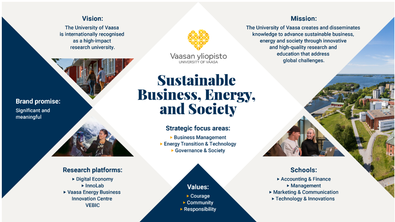
Figure 2. Overview of the University of Vaasa Strategy 2030.