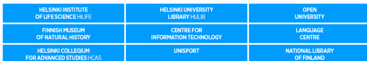
Figure 1: Organisation chart of the UH

Degree education is organised into degree programmes, which may include studies in one or more disciplines.