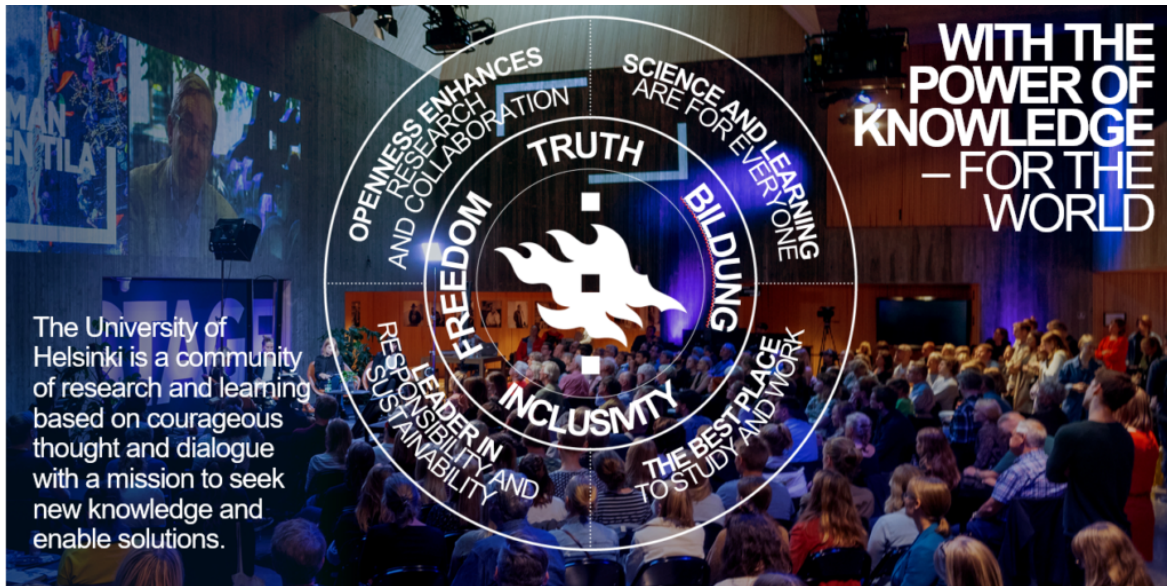
Figure 3. Strategic Plan of the University of Helsinki 2021–2030

To put the strategic plan into effect, the UH and its units have drawn up implementation plans for years 2021–2024. These plans can be found in the Suunta system, which is used to monitor and update the plans regularly as part of the UH’s operations management process. In addition, the strategic indicators defined by the UH itself are monitored.