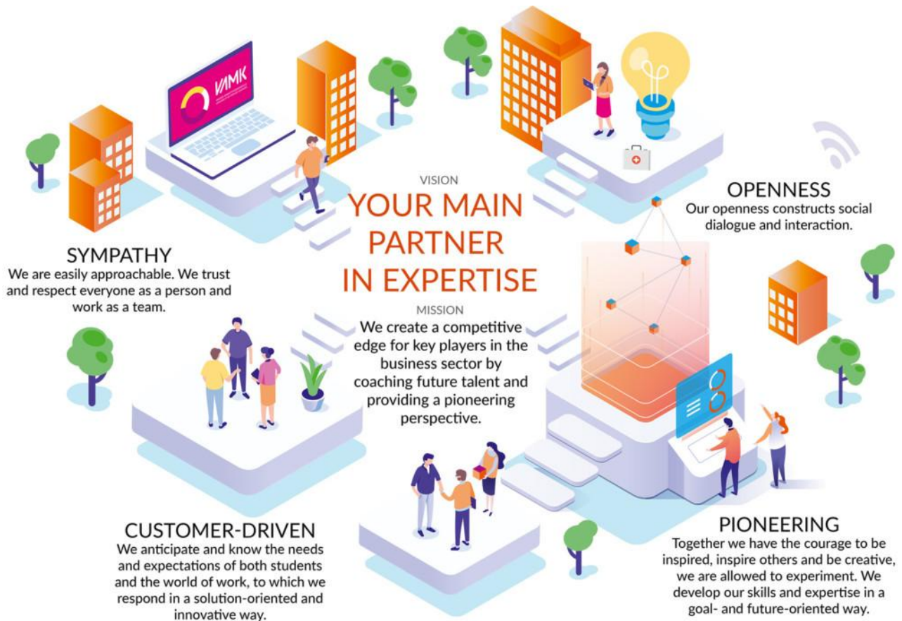
Figure 2. VAMK's strategy, vision, mission and values

VAMK's vision, mission and values are described above (Figure 2.).