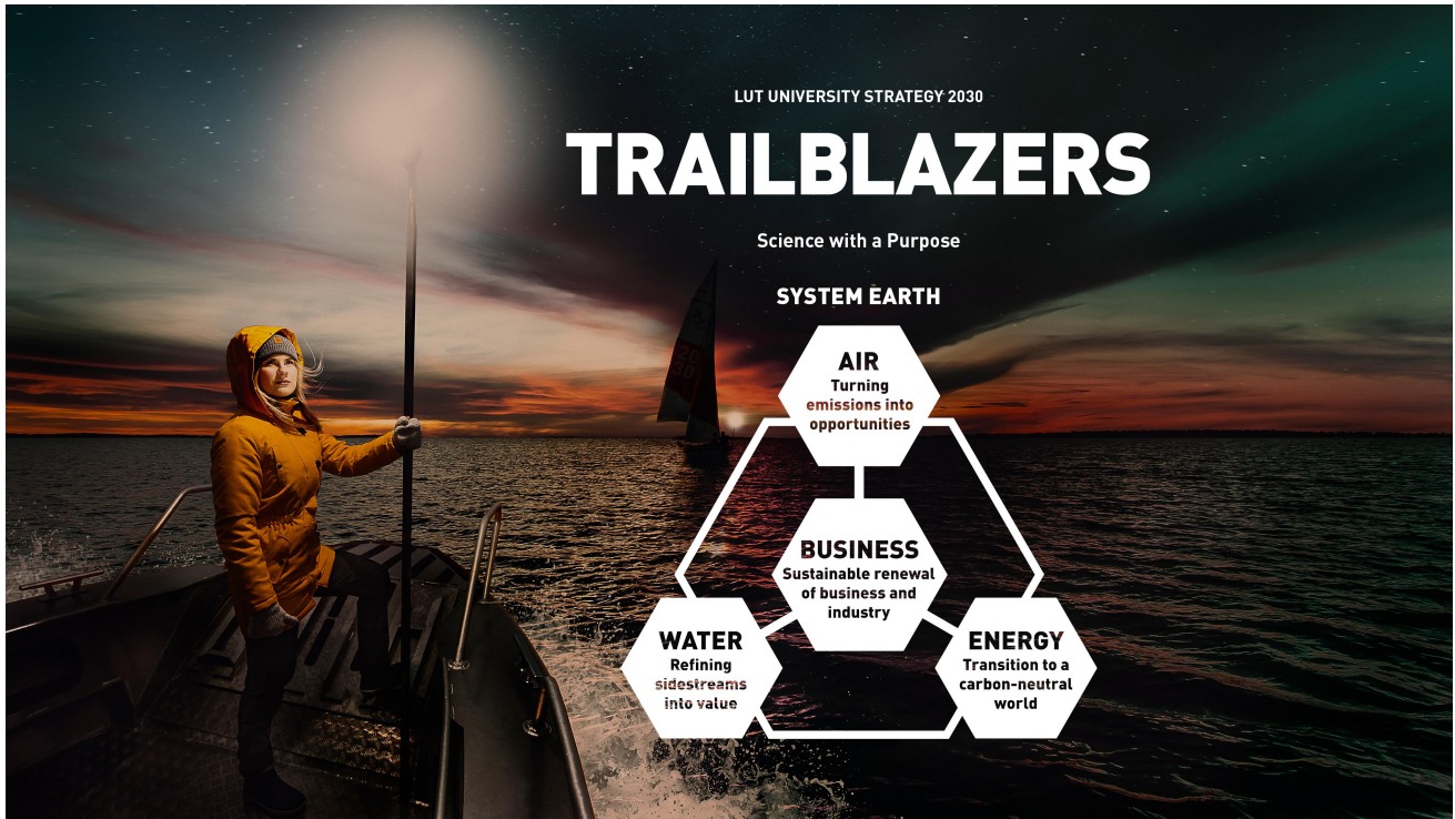
Figure 2: Strategic focus areas of research

In its strategy, LUT emphasises the impact of its activities ( strategy video ). The strategy is complemented by action plans that define concrete actions to achieve the strategic targets. The action plans cover the following themes: