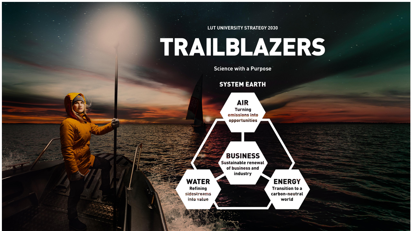
Figure 2: Strategic focus areas of research

In its strategy, LUT emphasises the impact of its activities ( strategy video ). The strategy is complemented by action plans that define concrete actions to achieve the strategic targets. The action plans cover the following themes: