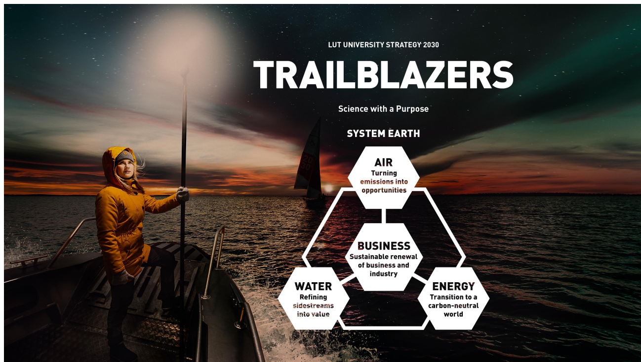
Figure 2: Strategic focus areas of research

In its strategy, LUT emphasises the impact of its activities ( strategy video ). The strategy is complemented by action plans that define concrete actions to achieve the strategic targets. The action plans cover the following themes: