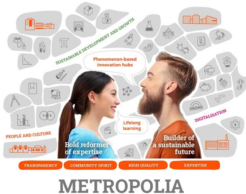
Figure 1 Metropolia's values and strategic themes

on Metropolia's values: transparency, community spirit, high quality and expertise. At the core of the strategy are lifelong learning and phenomenon-based innovation hubs . Metropolia implements them through three intersecting themes: sustainable development and growth , people and culture , and digitalization . The strategic themes form a systemic, open entity in which various contributing factors influence each other (figure 1). Metropolia's international actions support the implementation of the strategy for university of applied sciences and encompass all operations. The objectives are laid out in the International Action Plan.